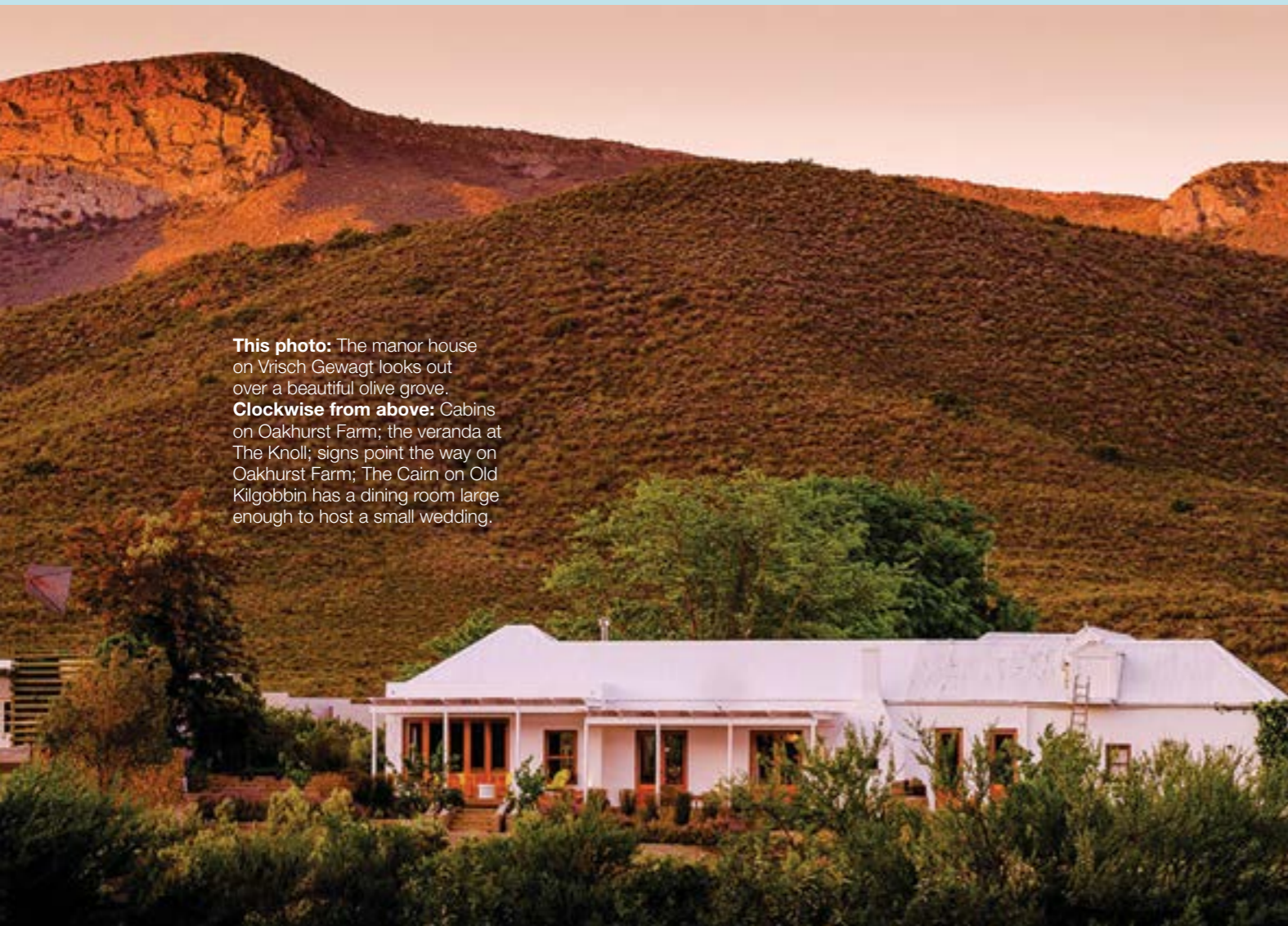
This photo: The manor house on Vrisch Gewagt looks out over a beautiful olive grove. Clockwise from above: Cabins on Oakhurst Farm; the veranda at The Knoll; signs point the way on Oakhurst Farm; The Cairn on Old Kilgobbin has a dining room large enough to host a small wedding.